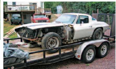
SUNSHINE TIME ::: Finally, the car is rescued from its prison. INTERIOR ::: Interior looks better already. COOL STRIPES ::: After a quick bath, the custom stripes can be seen. LOADED UP ::: Car is loaded up and ready for the trip home. CF