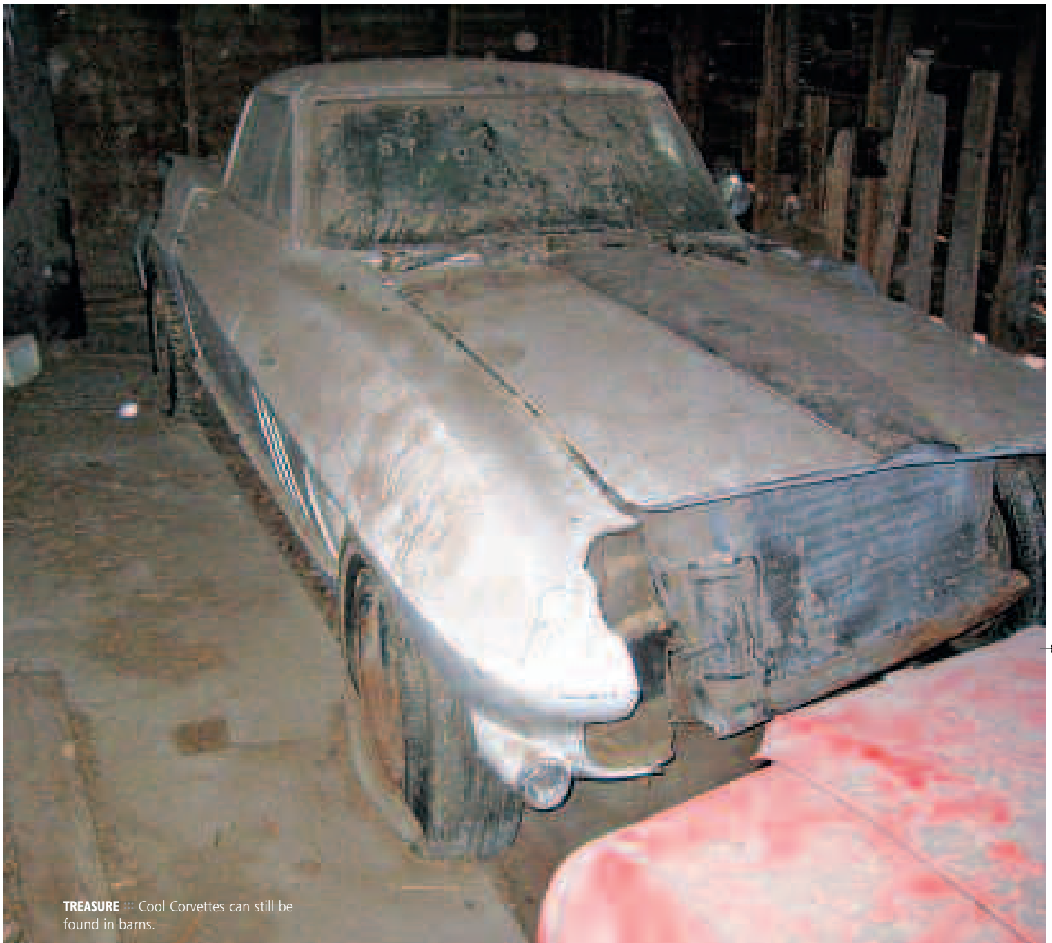
TREASURE :: Cool Corvettes can still be found in barns.

had always wondered what had happened to the car.