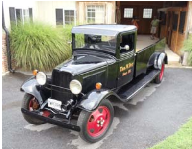
T.W. Perry's '32 Ford Pickup