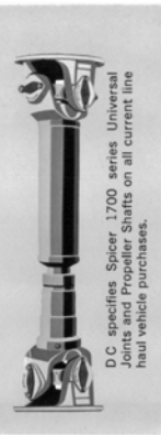
DC specifies Spicer 1700 series Universal Joints and Propeller Shafts on all current line haul vehicle purchases.