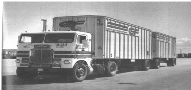
Looking for the C-F Terminal sign... Might be in Kansas City!

That is it for now. Start polishing up for Springfield, Mass. That should be a tremendous event and I assume B-W will be there in force.