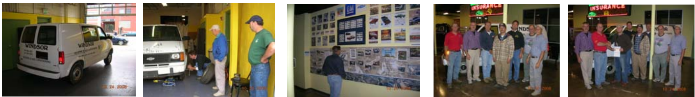
B-W ATHS members delivered and installed the 1970 GM Astro Van for new General Motors display at BMI