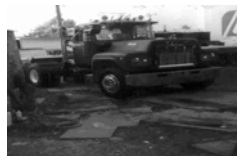
'79 R600 Carl Groth