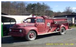
'52 Ford F-7 Pumper